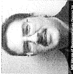
MN House of Representatives District 2A